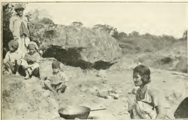
A KHASI INDUSTRY—FRYING FISH IN THE OPEN AIR.

It happened that the daughter-in-law was absent that night, so that the stranger saw only the parents and their son.